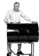
Rock-It to horizontal position

ALL MODELS SHIP SET UP VIA UPS - HANDLE SHIPS IN SEPARATE BOX