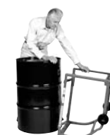
Tilt drum and slide Rock-It nose under chime