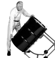
Push drum back on stand and grasp top and bottom chime