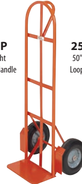
250SP 50" Height Loop Handle