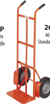
260SP 46" Height Standard 2 Handle

• INDUSTRIAL STRENGTH • TWO YEAR WARRANTY