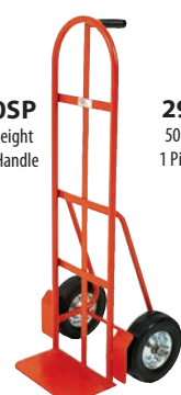
291SP 50" Height 1 Pin Handle