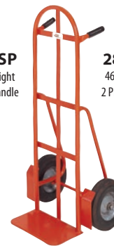
282SP 46" Height 2 Pin Handle