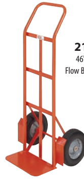
210SP 46" Height Flow Back Handle