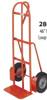
280SP 46" Height Loop Handle