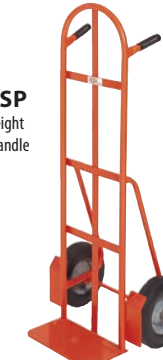
292SP 50" Height 2 Pin Handle