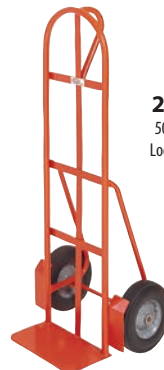
290SP 50" Height Loop Handle