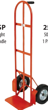
251SP 50" Height 1 Pin Handle

SEE PAGE 35 FOR OUR POPULAR 200 SERIES 2-IN-1 CONVERTIBLE TRUCK