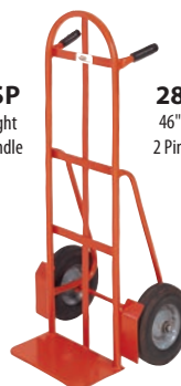
282SP 46" Height 2 Pin Handle