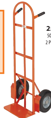
252SP 50" Height 2 Pin Handle

SEE PAGE 35 FOR OUR POPULAR 200 SERIES 2-IN-1 CONVERTIBLE TRUCK