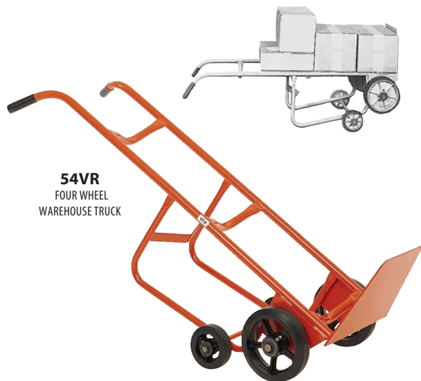
54VR FOUR WHEEL WAREHOUSE TRUCK