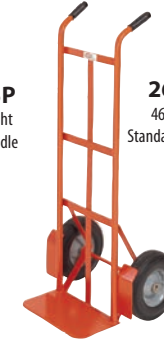
260SP 46" Height Standard 2 Handle

• INDUSTRIAL STRENGTH • TWO YEAR WARRANTY