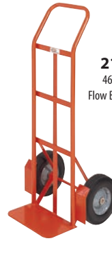
210SP 46" Height Flow Back Handle