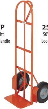
250SP 50" Height Loop Handle