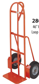
280SP 46" Height Loop Handle