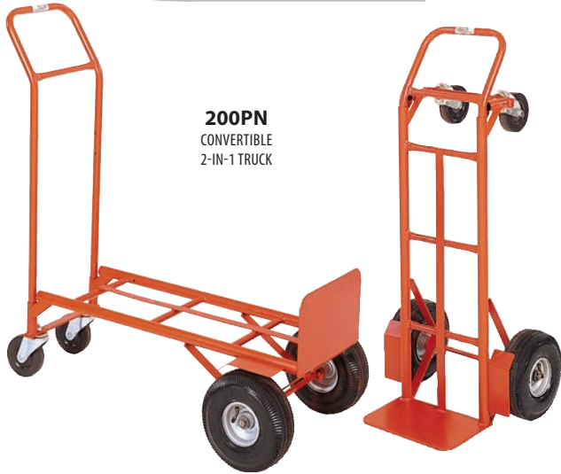
200PN CONVERTIBLE 2-IN-1 TRUCK