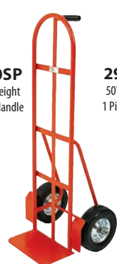
291SP 50" Height 1 Pin Handle