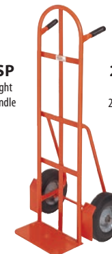
292SP 50" Height 2 Pin Handle