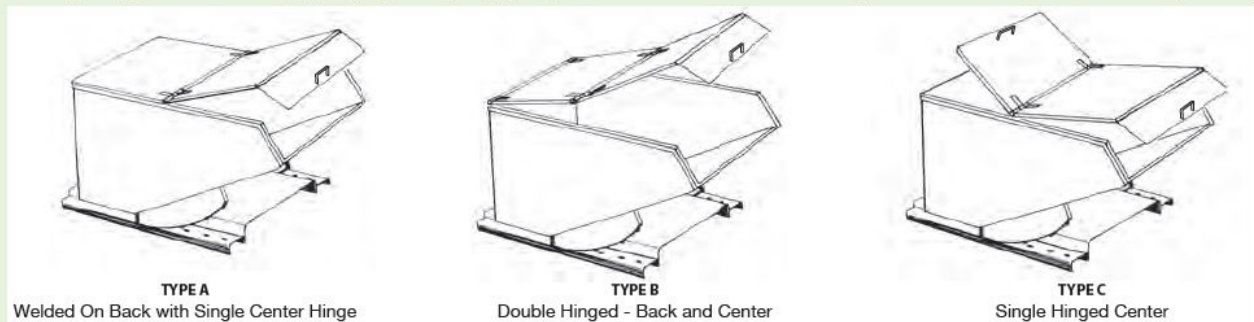
TYPE A Welded On Back with Single Center Hinge

When ordering a hinged lid for a self dumping hopper, please specify type A, B or C as set forth below. Indicate the type as a suffix to the model number. Example HL100A.