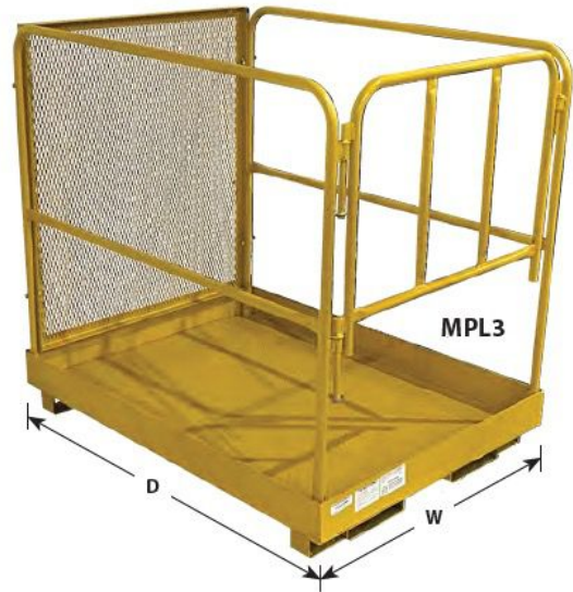
MPL3 With Optional Riser Screen (BCR36), Tube Caddy (FBC), Tool Tray (TT36) and Casters (CK3P)

MECO OMAHA FORKLIFT PLATFORMS CONFORM TO ANSI/ITSDF STANDARD B56.1-2012.