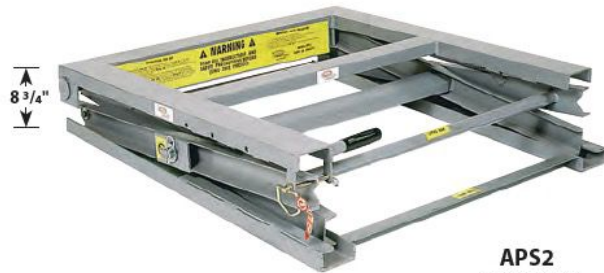
APS2 In Folded Position