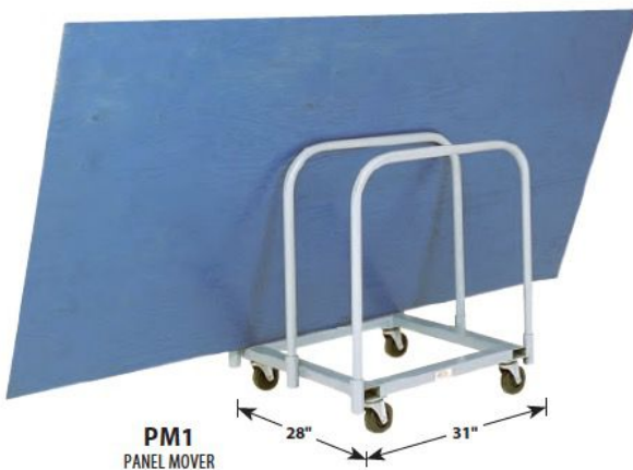
PM1 PANEL MOVER

A hefty 12 ga. steel frame supports long, bulky items that must be moved on edge. The PM1 consists of an all-steel frame; the PM2 has two non-slip carpeted cross battens to protect fragile items. Three removable U-rails provide two 11 1/2" wide load bays, rails extend 27 1/2" above the PM1 frame and 26" above the PM2 frame. Both units ship knocked down in a carton via UPS. Gray enamel finish with galvanized steel U-rails. All-swivel casters are bolted to the frame for easy replacement.